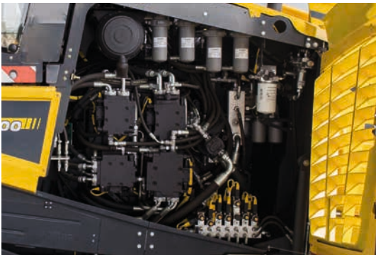
Save up to 17 % fuel – demand-driven hydraulics – with BOMAG ECOMODE.