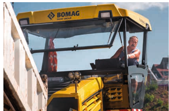
The right position in each situation – the comfortable driver's cabin.