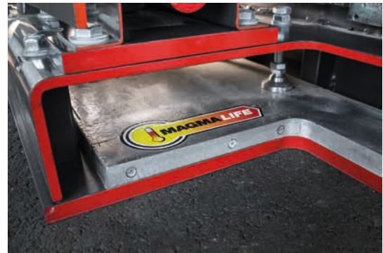
Heats up nearly 60 % quicker – unique MAGMALIFE heating system.