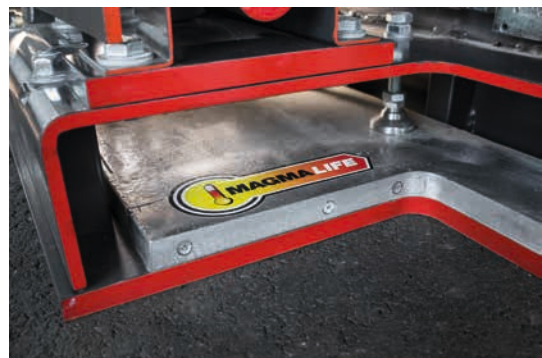
Heats up nearly 60 % quicker – unique MAGMALIFE heating system.