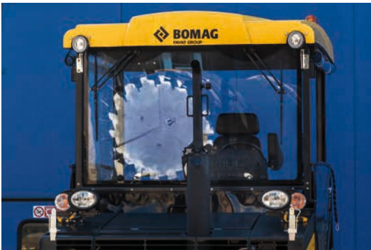
Optional weather protection – for maximum convenience.