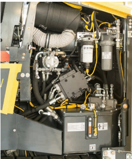
Save up to 17 % fuel – demand-driven hydraulics – with BOMAG ECOMODE.