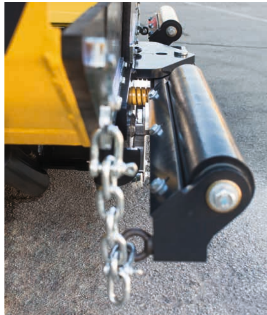
Impact-free docking – dampened bumper.