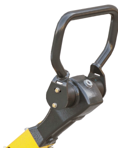
Precise and save to operate Comfortable control lever