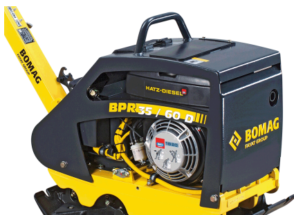
Robust and reliable Best component protection