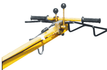
Precise and save to operate All function integrated in the steering rod head