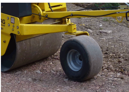
Comfortably to control Wheel set (optional)