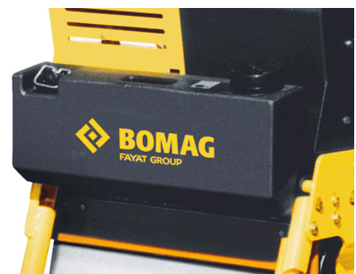
No sticking of asphalt Water spraying system with large water tank (standard)